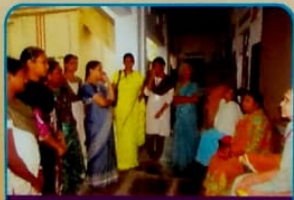
Visit to Oldage Home - Dept. of Computer Science