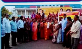
Janmabhoomi - Maa Vooru Programme -NSS