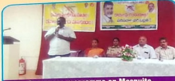
Awareness programme on Mosquito Bite Prevention