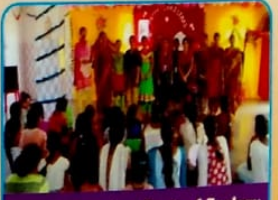
Visit to Swadhar - Dept. of Zoology