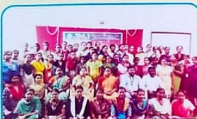
Hinduja Global Solutions- Placement Cell