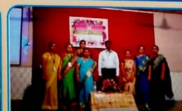
Endowment Lecture - Dept. of Mathematics