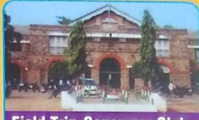
Field Trip-Consumer Club