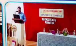
Endowment Lecture - Dept. of Commerce