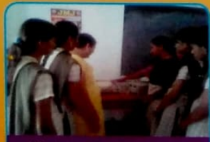
Workshop - Dept. of Physics