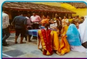
Semi Christmas Celebrations - AICUF