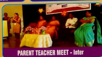
PARENT TEACHER MEET - Inter