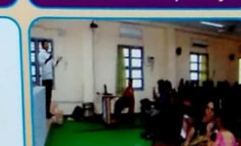
Endowment Lecture - Dept. of Zoology