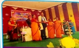
College Annual Day