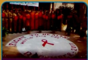
World AIDS Day