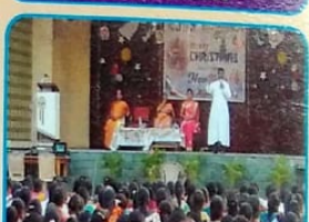
Semi Christmas Celebrations