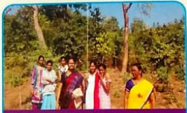
Botanical Tour-Dept. of Botany