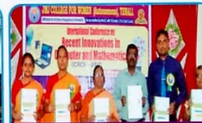
International Conference - Computer Science & Maths