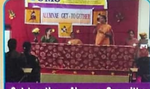
Get-together - Alumnae Committee