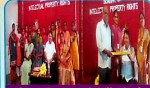
Guest Lecture- Intellectual Property Rights