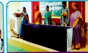
International Womens Day