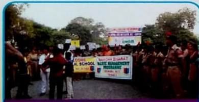
Swachatha, the way ahead - NCC