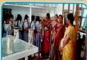
School to Lab