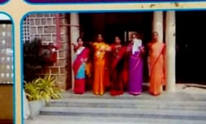
National Voters Day