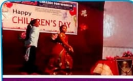
Childrens Day Celebrations- Dept. of Zoology