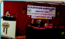
Endowment Lecture - Dept. of Home Science