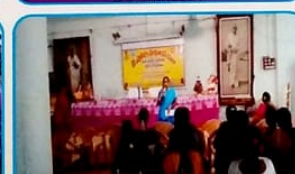
Kishori Balika Vikasam-Dept. of Home Science