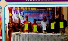
National Seminar - Chemistry