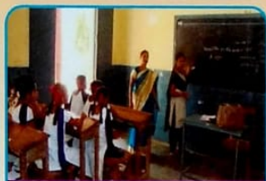
School Activity - Dept. of Zoology