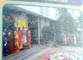
Sankranti Sambaralu - Dept. of Home Science