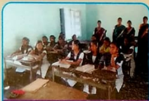
School Activity - Dept. of Humanities