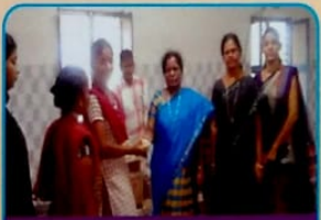
Visit to Swadhar - Dept. of Botany