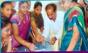
Guest Lecture - Dept. of Zoology