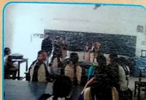
Role Play on Obedience Dept. of Botany