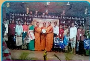
receiving 1st prize in Intercollegiate skit competition