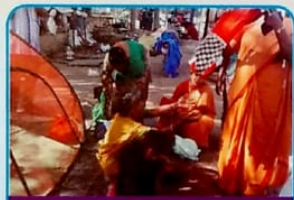
Semi Christmas with the Homeless