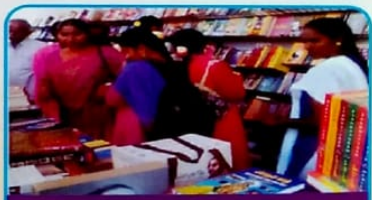
Visit to Book Exhibition - Dept. of Telugu