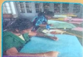
Poster Presentation Competition - Dept. of Home Science