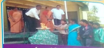
Annual Sports Day