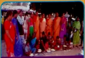
Obreving world Day the Poor