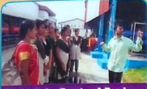
Field Trip-Dept. of Zoology