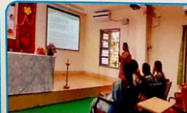
Endowment Lecture - Dept. of Chemistry