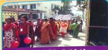
AIDS Awareness Rally - Youth Red Cross