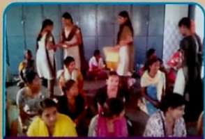
VISIT TO SWADHAR HOME - AICUF