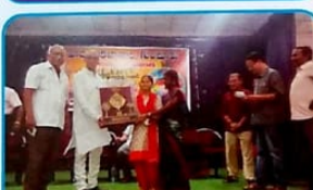
Intercollegiate Competitions- Cultural Committee