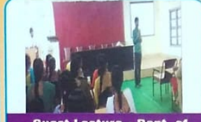
Guest Lecture - Dept. of Computer Science