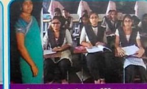
Guest Lecture-Women Empowerment Cell