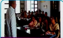
Endowment Lecture - Dept. of Botany