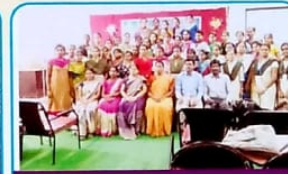
ICICI Campus Drive-Placement Cell