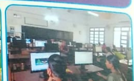
Computer Painting Competition- DEPARTMENT OF COMPUTER SCIENCE