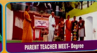
PARENT TEACHER MEET- Degree