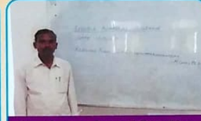
Guest Lecture- Research Committee