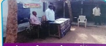
Awareness Programme- Consumer Club