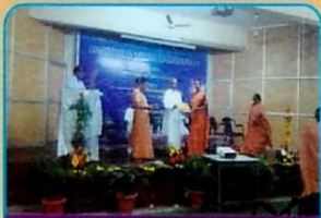
Received "The Pride of the Catholic Church" Award