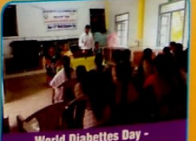
World Diabetes Day - Dept. of Home Science