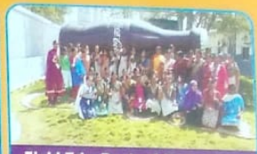
Field Trip-Dept. of Humanities