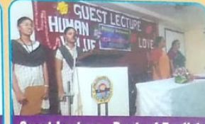
Guest Lecture - Dept. of English