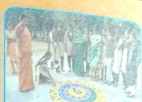
Rangoli Competitions - Cultural Committee