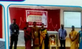
Endowment Lecture - Dept. of English