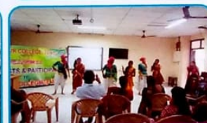
Intercollegiate Meet-Cultural Committee