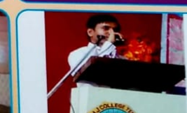
Endowment Lecture - Dept. of Telugu