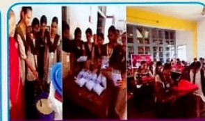
HomeCrafts Training Programme -Women Empowerment Cell