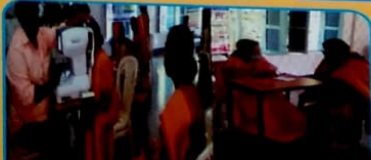
Eye and Dental Camp-NSS,NCC, Red Ribbon Club