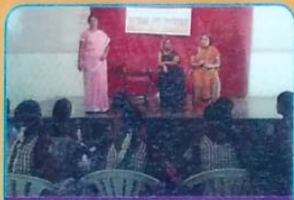
Personality Development Programme - Alumnae Committee