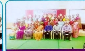
ILM Campus Drive-Placement Cell