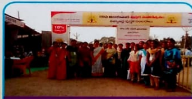
Visit to Book Exhibition - Dept. of English