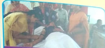
Blood Donation Camp-NSS,NCC